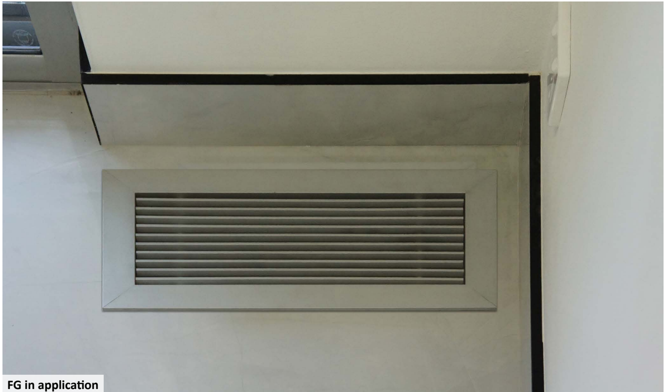
FG in application