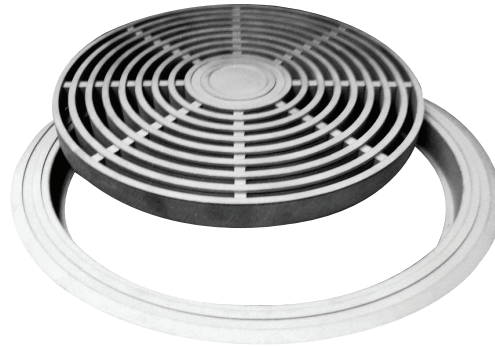
Type 'FBA/250' Floor Diffuser